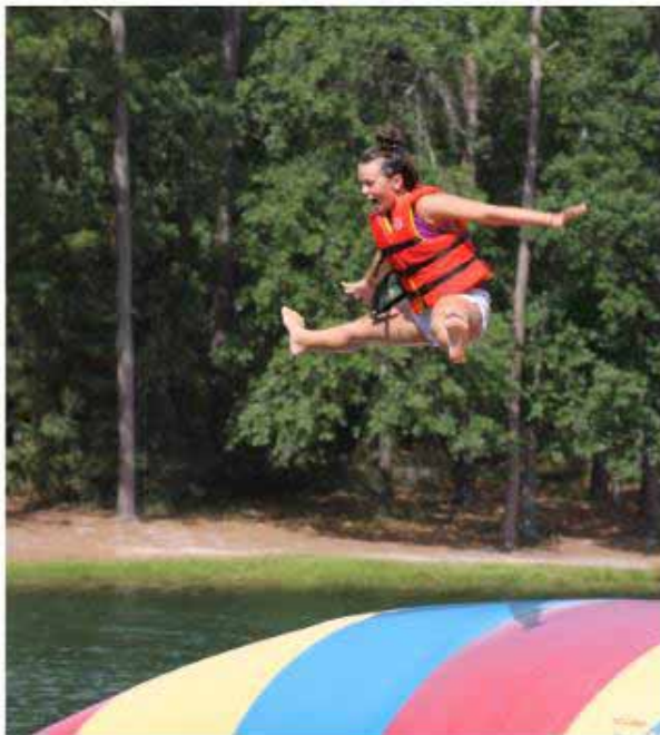
Soaring to new heights on the Blob!

The campers arrive on Sunday afternoons with all of the anticipation of meeting new friends and trying new activities. They are greeted