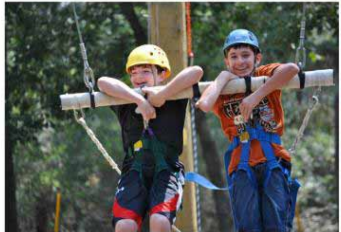
The Giant Swing is a new addition to our challenge course that was funded through Starry Nights Donors.

by our senior staff and counselors with their bright orange shirts and smiling faces. These staffers have arrived at camp weeks before the campers do in order to fine-tune their safety training, prepare the activity areas, create props, and build relationships with students from a variety of college campuses.