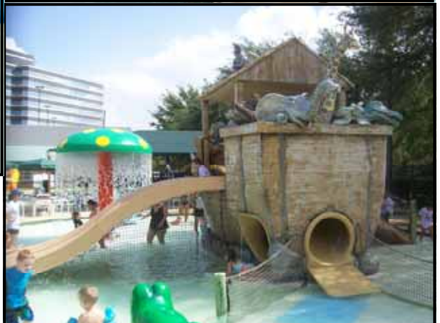
FIELD TRIP FUN SUMMER 2011